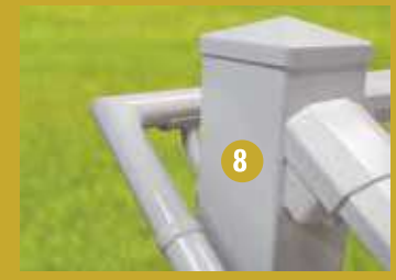
90° Welded Elbow Detail