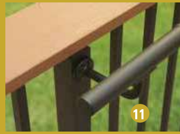
Extended Wall Mount Detail