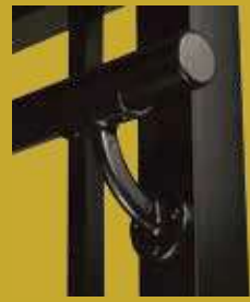
Wall Mount & Internal End Cap Detail